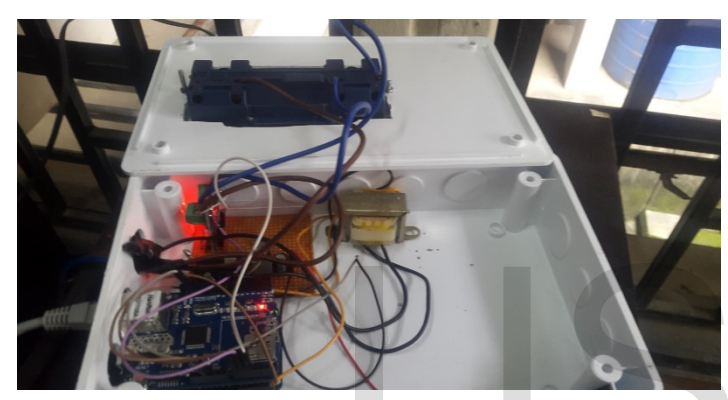
Figure 4: Snapshot of the coupled components

After simulation, the project was tested on a breadboard using the procurred hardware components before being soldered and screwed firmly to the board as shown in figure 4.