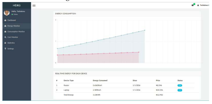
Figure 5: Energy Monitor displaying the readings for the connected appliances

The finished project was able to measure and manage two devices with ratings up to 7.2kW. The results for two devices, a 90W rated laptop and a 16W rated router, connected to the system are shown in figure 5.